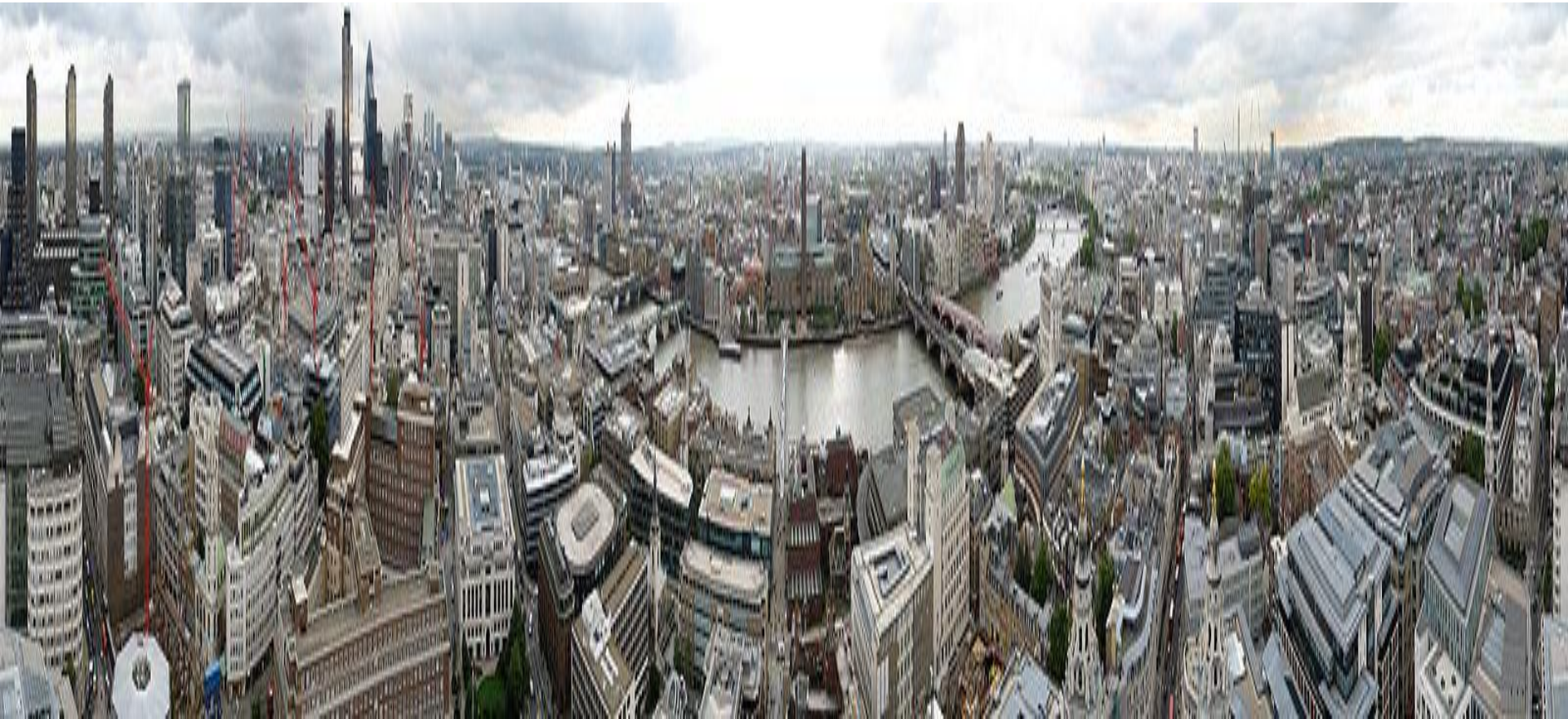
A panorama of modern London, taken from the Golden Gallery of Saint Paul's Cathedral